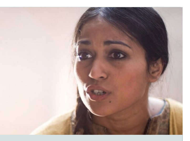
"They have taken the Lord from the tomb, and we don't know where they put

Acts 5:12-16: Revelation 1:9-11a, 12-13, 17-19 John 20:19-31