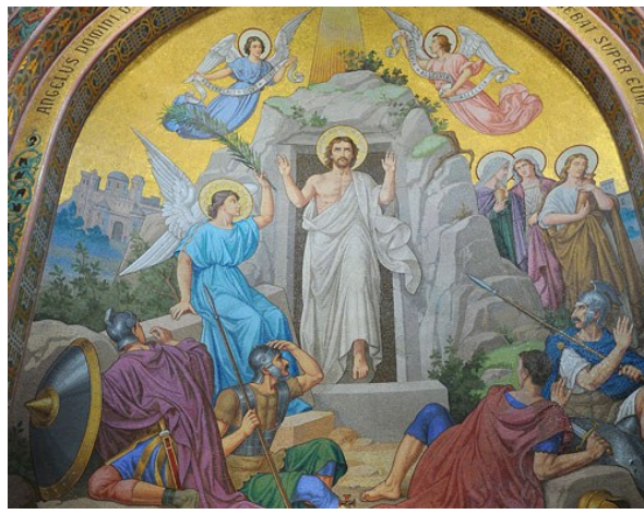
Mosaic in a chapel at the Basilica of Our Lady of the Rosary in Lourdes, France.