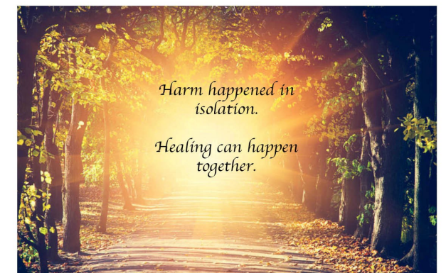
As a community, we strive to support survivors of child sexual abuse on their journey toward healing and wholeness.

"The spirit of the Lord God is upon me because the Lord has anointed me." God is empowering you for a specific purpose! How will you respond to so great a love? Is He asking you to follow Him by serving in the priesthood or consecrated life? Talk to your priest or reach out to the Office of Vocations at (804) 359-5661 or via email: vocations@richmonddiocese.org .